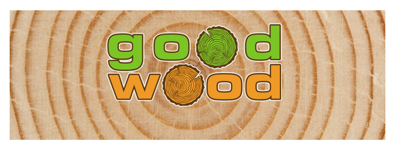
9 December 2020, Brussels